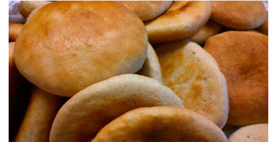
Shared bread.

Then Jesus directed them to have all the people sit down in groups on the green grass. So they sat down in groups of hundreds and fifties. Taking the five loaves and the two fish and looking up to heaven, he gave thanks and broke the loaves. Then he gave them to his disciples to distribute to the people. He also divided the two fish among them all. They all ate and were satisfied, and the disciples picked up twelve basketfuls of broken pieces of bread and fish. The number of the men who had eaten was five thousand.