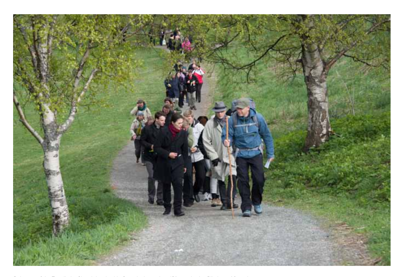
Delegates of the Trondheim Church Leadership Consultation make a 'Climate Justice Pilgrimage' from the Trondheim Free Church to Nidaros Cathedral, Norway, May 13, 2015.