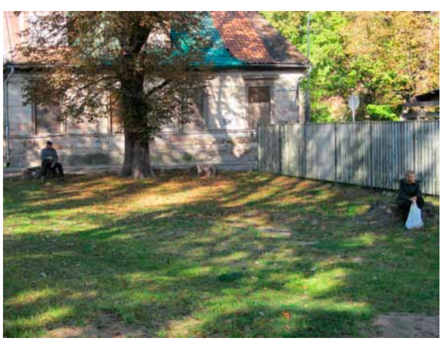
Work migration from Latvia leaves behind abandoned homes and the older generation.

Allow each participant in the group to speak about his or her experiences. If there is only time for two or three people to tell their stories at one session, continue next time. There's no need to rush. It is important to hear each participant's story. It is critical that participants speak about their own personal experiences, not offer the official media version regarding austerity. For this to happen there needs to be trust among the group members. There may be hurtful experiences to talk about. Perhaps a family member has had to travel to another country to earn a living. Or maybe someone has had to sacrifice their flat because of debts. After stories have been shared, other group members may ask questions without getting in a discussion or proposing solutions to questions that haven't been asked. It is possible to film the stories and include the footage as a part of a wider film project.