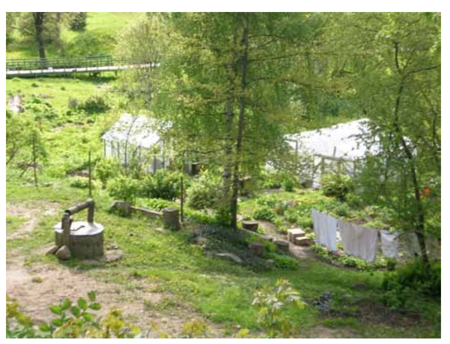
Village scene in Latvia.

What is the background of this text? The formative event in the history of Israel was their release from slavery. The reason for this liberation was not primarily on the grounds of religion. The Israelites were slaves, yes – and