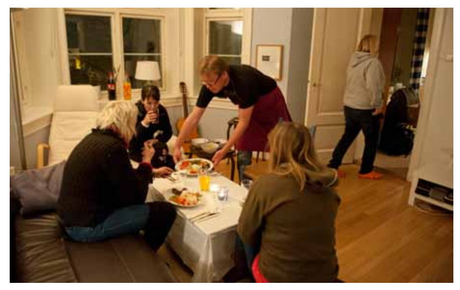
Sharing a meal at the Women's Night Shelter in Oslo.

We are challenged on how we value people: through wealth, intellect, education, position, power, passport or inheritance, etc. Jesus compels us to look again at how we go about judging the value and dignity of different persons. As long as we can rate people differently, according to skills, education, wealth, and so on, we will