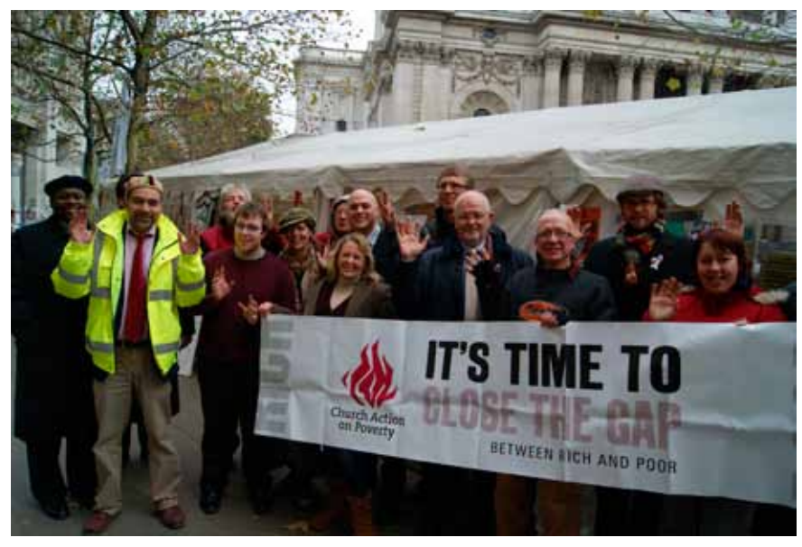
Church leaders express support for protesters against austerity

✓ Do you now know enough about the situation of people in debt in your community? How big a problem is it? Do you need to do more research into the extent of the problem? Who else and which other organizations may be interested in this issue?