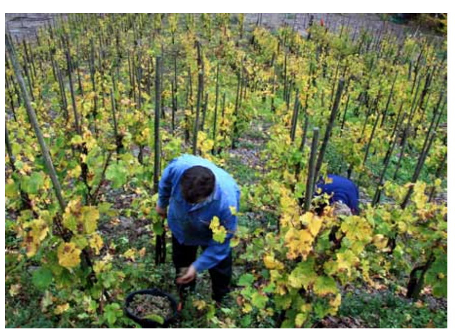
Wine harvest in Moselle.

Work is an essential form of participation in society. Those who do not get work are excluded from society.