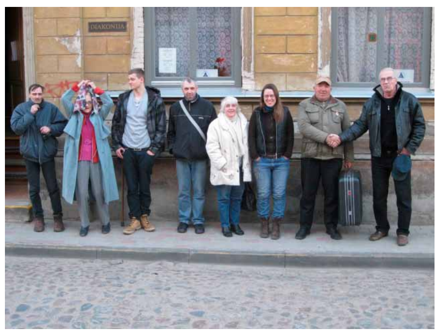
The group "Talks about the Bible and life" at The Congregation of the Cross, Liepaja, Latvia.

Make a modern film version of the parable of the unmerciful servant.