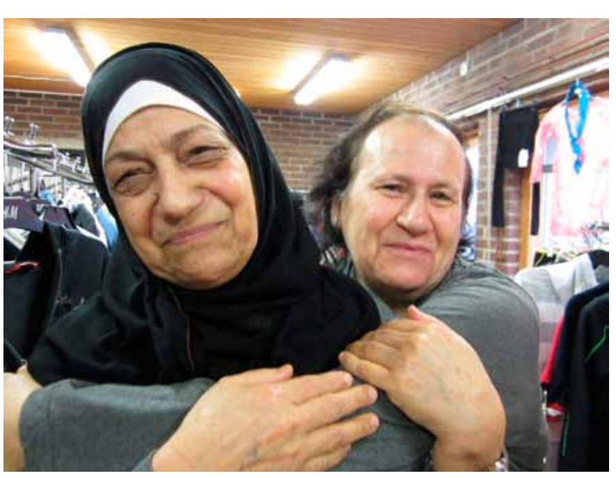
Different faiths and good neighbors in Angered, Sweden.

Portraying a Samaritan in a positive light would have come as a shock to Jesus' audience. Read the text slowly. Try to pretend that you are a member of the majority population and feel the reaction among the people listening to Jesus.