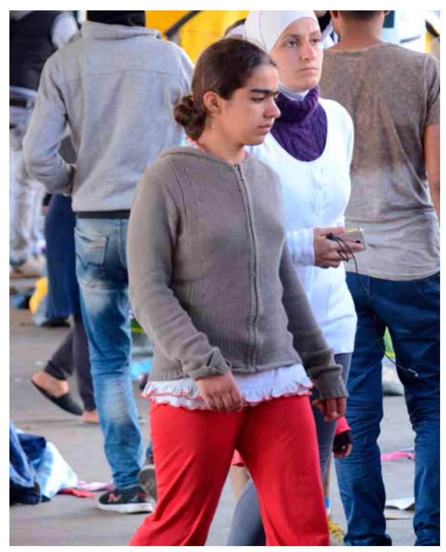
Migrants in Kletin Station, Budapest.

Before they die in Moab, the sons marry two local girls, Ruth and Oprah. Following the death of their husbands, they remain with their mother-in-law, Naomi. When Naomi decides to go back to Bethlehem. Oprah heeds Naomi's advice and goes home to her