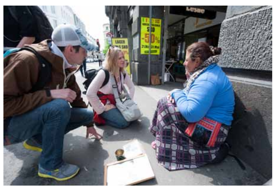
In dialogue with a person asking for support.

Initially, it seems as though the third definition contradicts the first one. At the same time, the first definition is understood as an objective statement, whereas the second very much describes a subjective experience. The third definition could indicate that status can differ from person to person; the first seems to indicate that we as persons are all equal in our worthiness.